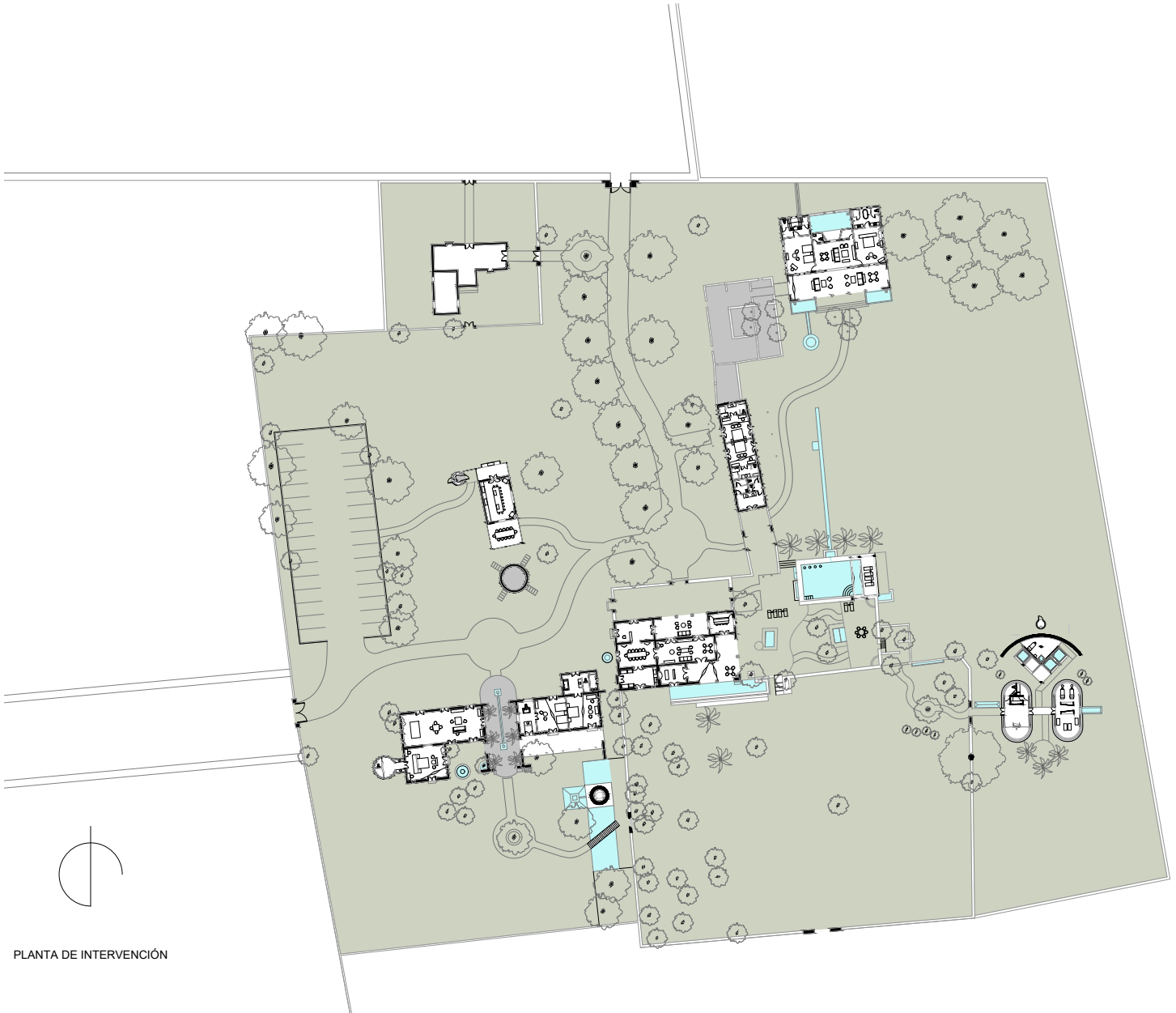
PLANTA DE INTERVENCIÓN